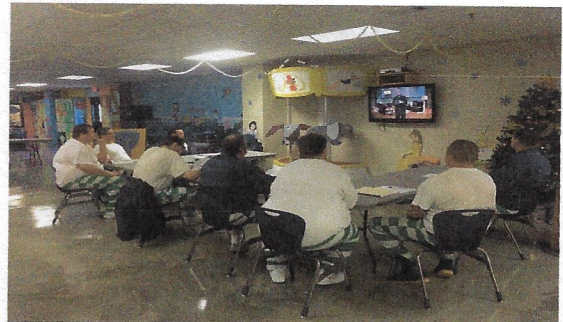
Stone County Correctional Facility Authentic Manhood group meeting